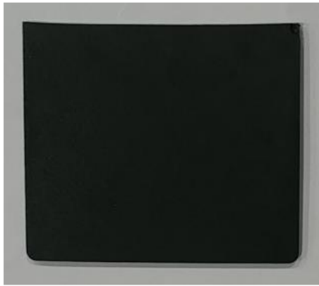
< Seiya Antibacterial Elastomer Sheet_A >

[remainder of page intentionally left blank]